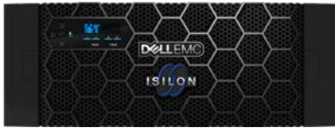
Dell EMC Isilon A2000

Isilon archive platforms are designed to provide highly efficient and resilient archive storage. Isilon A200 is an ideal active archive storage solution that combines near-primary accessibility, ease of use, and capacity. Isilon A2000 is designed for high density, deep archive storage.