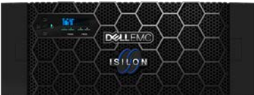
Dell EMC Isilon H600