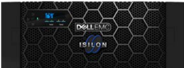
Dell EMC Isilon H400

Isilon hybrid platforms include Isilon H600 for high performance, Isilon H500 for a versatile balance of performance and capacity, and Isilon H400 to support a wide range of enterprise file workloads. With SSD technology for caching, Isilon hybrid systems offer additional performance gains for metadata-intensive operations.