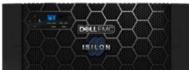
Dell EMC Isilon F800 All-Flash

The new generation of Isilon hardware systems allow you to consolidate and support a wide range of file workloads. With an ultra-dense, modular architecture that provides four Isilon nodes within a single 4U chassis, Isilon systems enables organizations to reduce data center space requirements and related costs by up to 75%. The new Isilon platforms seamlessly integrate with existing Isilon clusters.