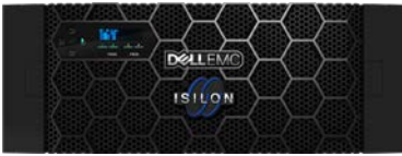
Dell EMC Isilon A200